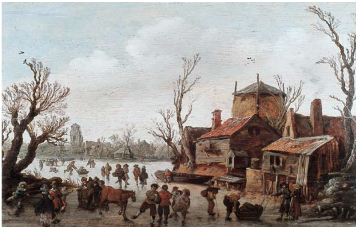
18. Village in winter time by Jan van Goyen (NK 2463).