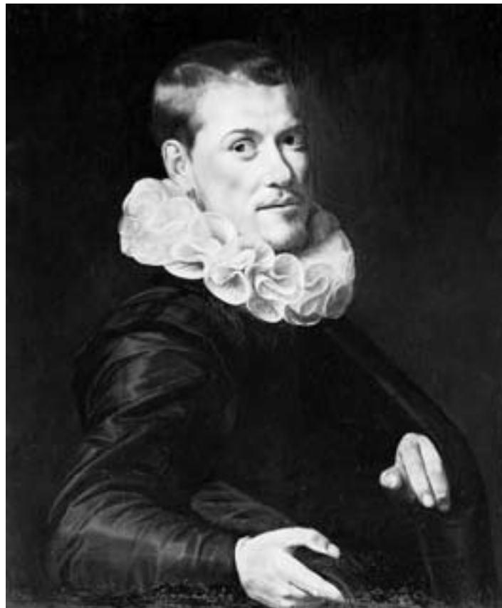
20. Portrait of a man by Thomas de Keyser (NK 2693).