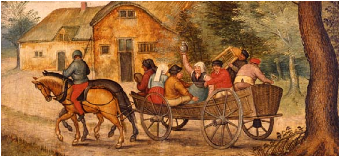
17. Peasants on a wagon by Pieter Brueghel II (NK 1410).

The object NK 2463 was also part of an application for restitution concerning the art dealership Firma D. Katz of Dieren (RC 1.90-A). The Committee was obliged to defer its recommendation in the present case until the investigation of NK 2463 was also completed. The applicants were informed about this in the draft investigatory report and in a letter of 28 October 2008. After concluding its investigation, the Committee rejected the claim to NK 2463 regarding the art dealership Firma D. Katz. The Committee refers to the text of the recommendation in RC 1.90-A for its decision in that case. NK 2463 will therefore be included in this recommendation.