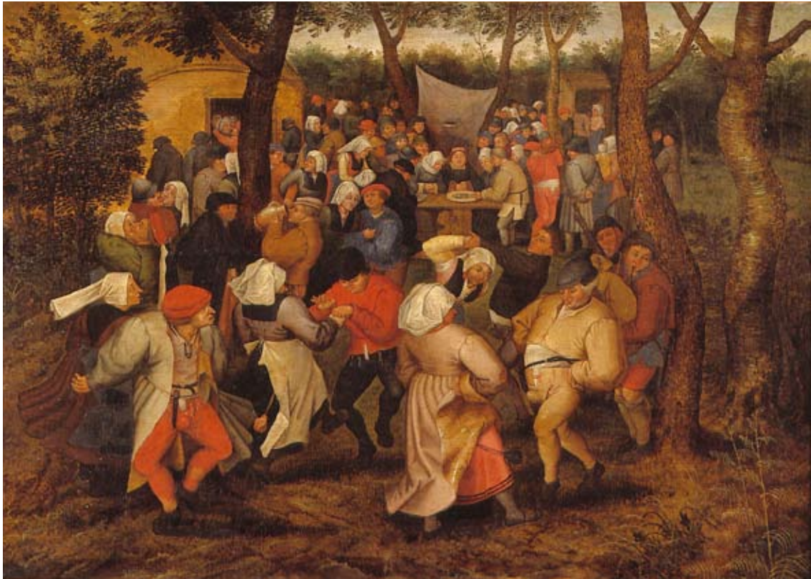
5. A country wedding by Pieter Brueghel the Younger (NK 2227). See recommendation RC 1.101.