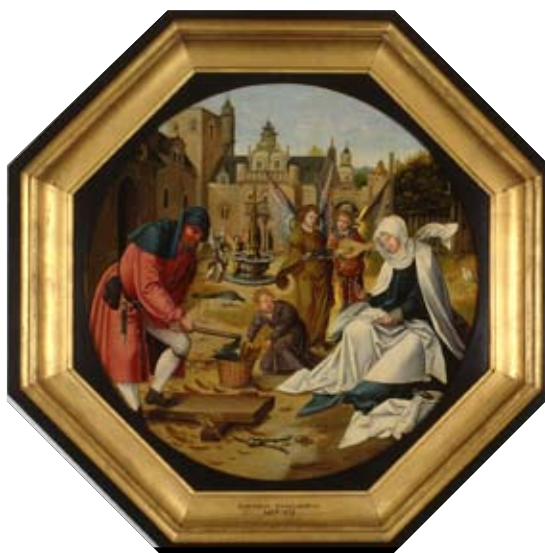
19. The Holy family by Cornelis Engelbrechtsz (NK 1412).