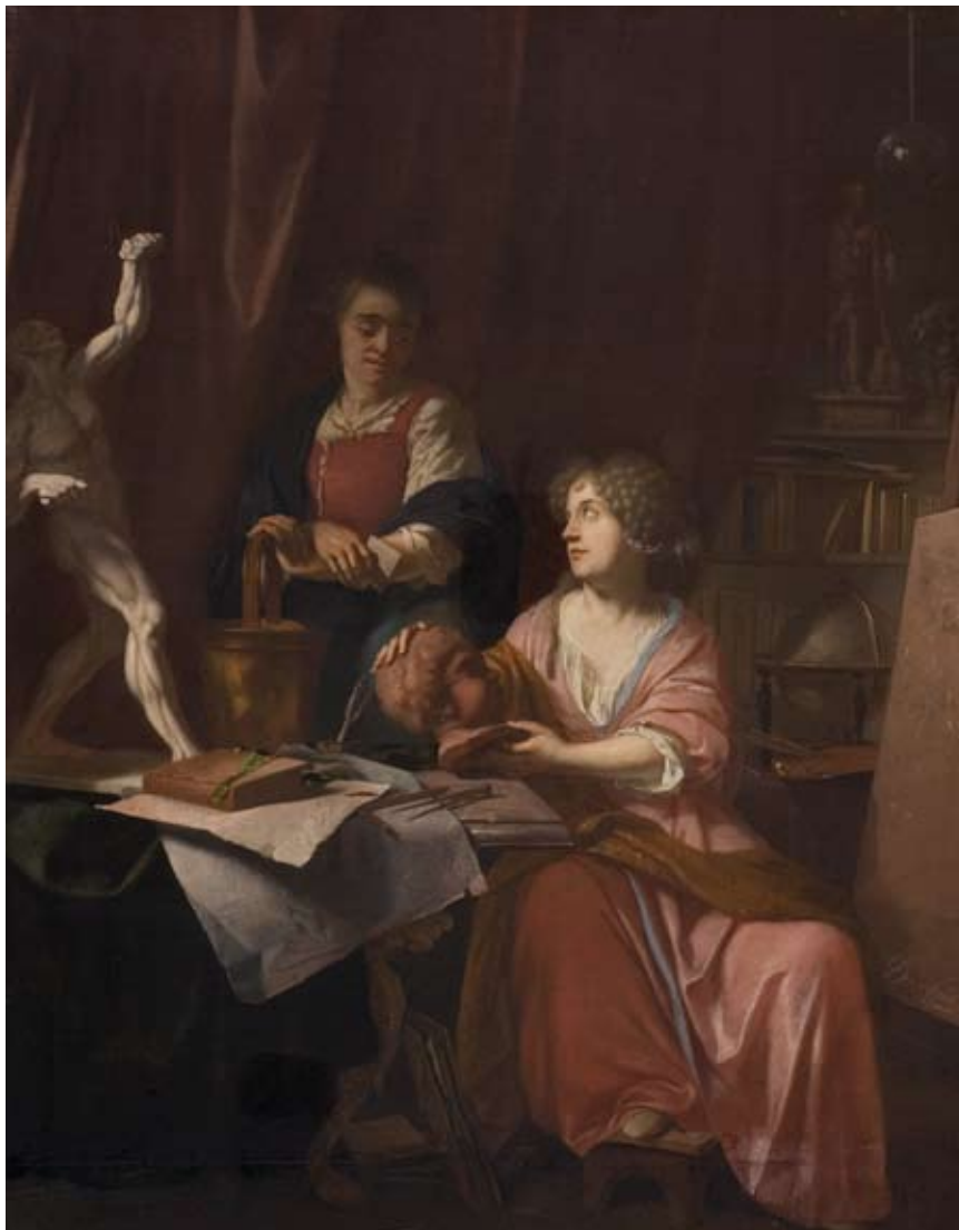
8. Paintress and servant in a studio by J. Voorhout I (NK 1973).