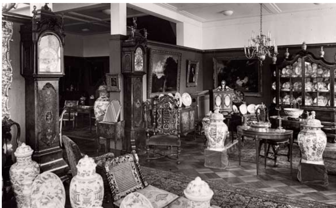
22. Interior of art dealership Katz in Dieren, 1936.