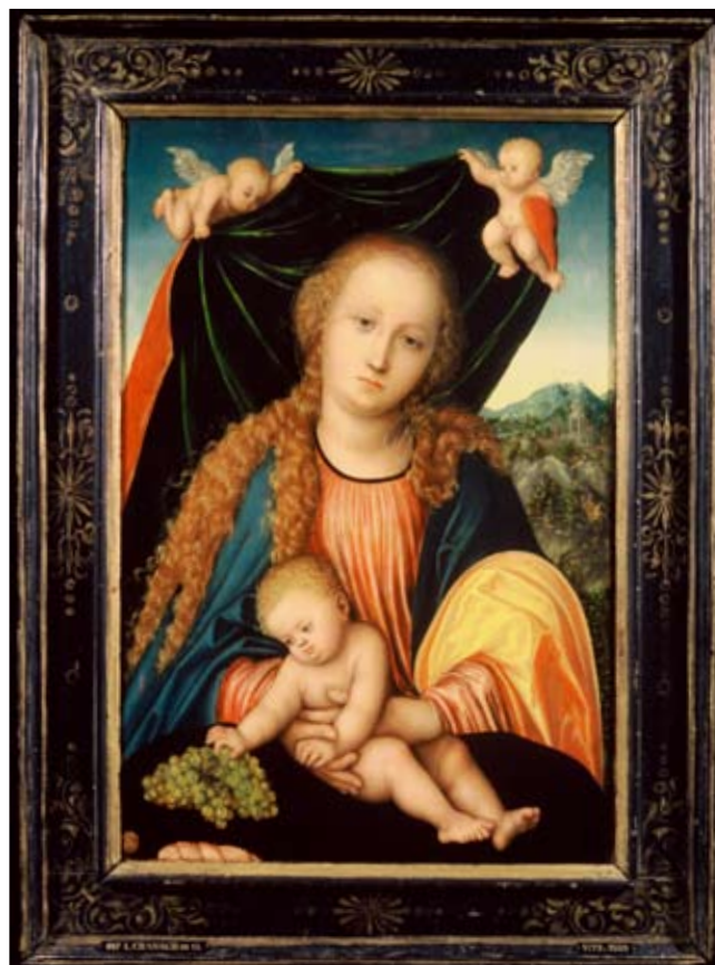
26. Madonna and child by Lucas Cranach (NK 3071).