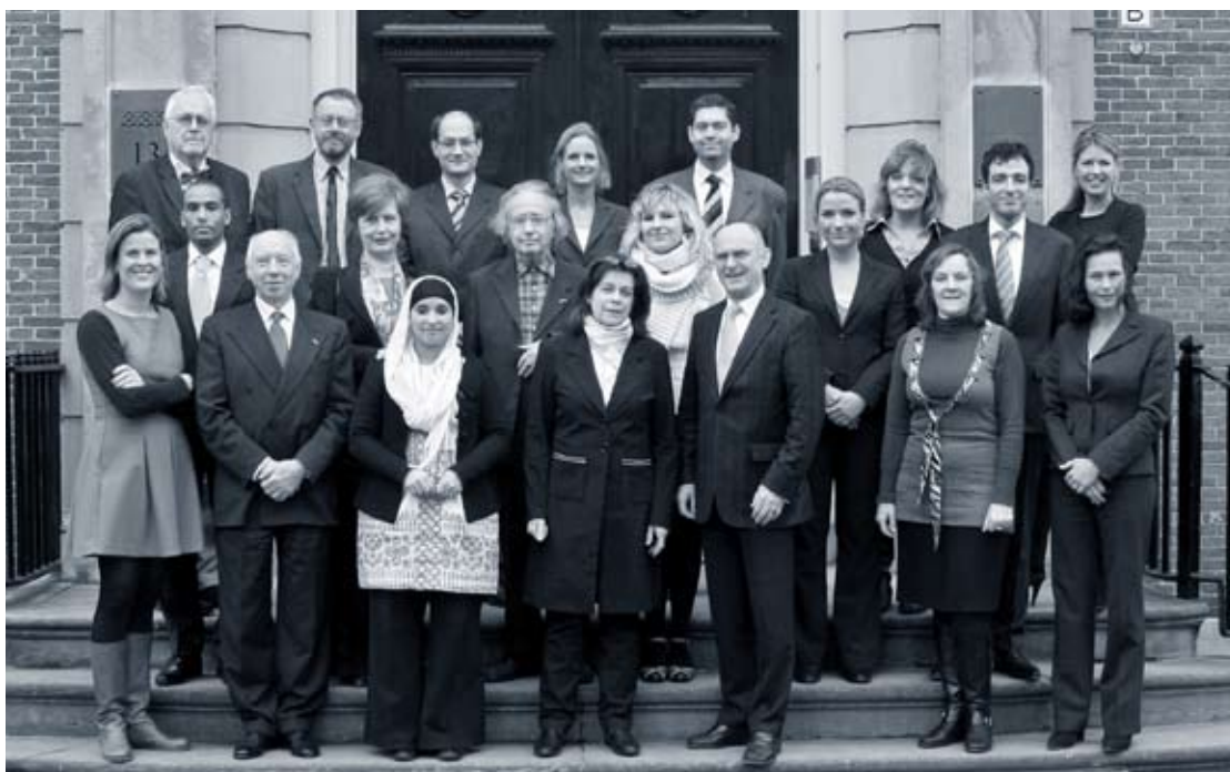
3. Members of the Restitutions Committee and members of the secretariat.