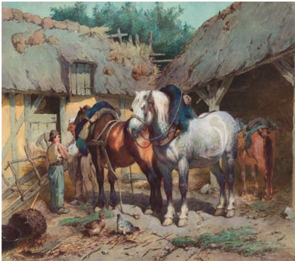
25. Horses by a stable , watercolour by W. Verschuur II (NK 2569).