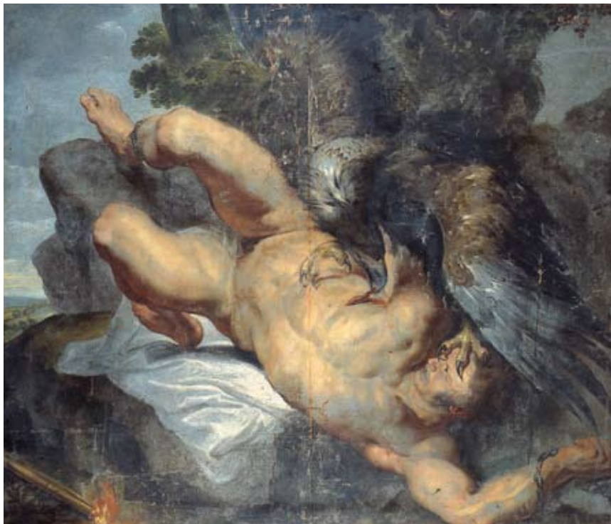
7. Prometheus chained to a rock after P.P. Rubens (NK 3082) .

While it is true that I sold the painting without being directly forced to do so by the German authorities, I felt – as I also informed you – that I was compelled to do so in connection with the imminent confiscation of my house at Koningslaan 17.