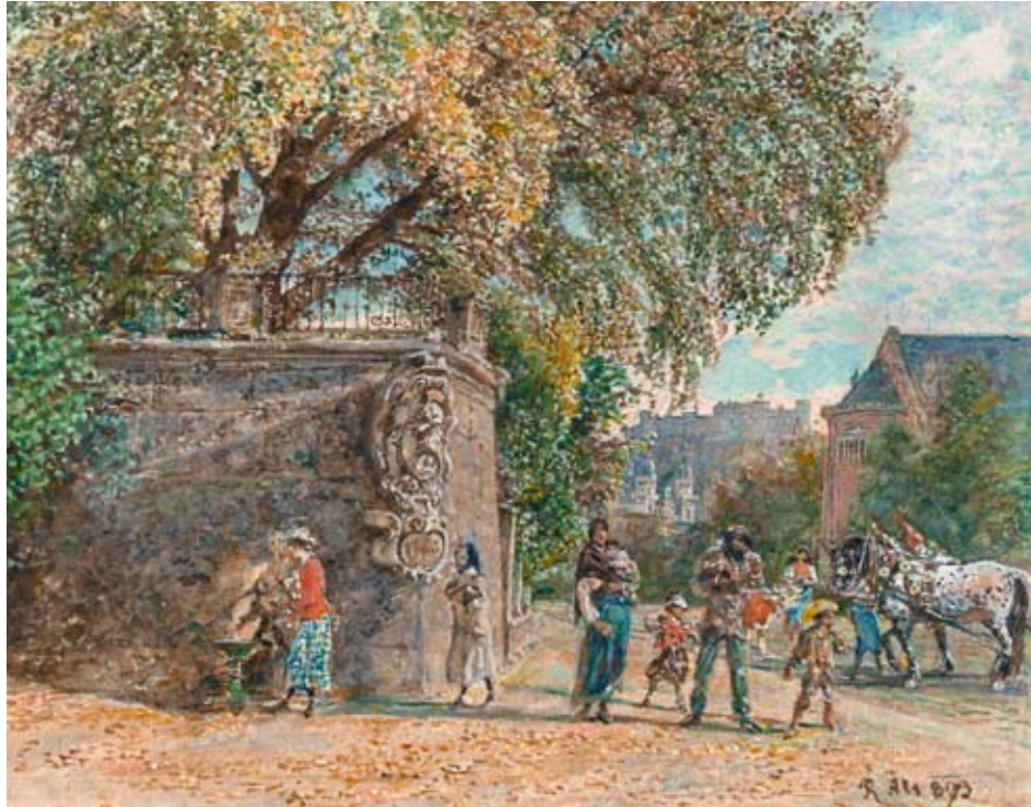
13. View of Salzburg , watercolour by Rudolf von Alt (NK 2897).