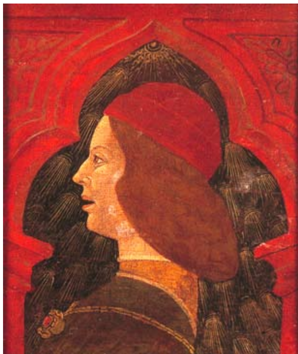
11. Anoniem, Portrait of a man (NK 2895).