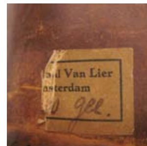
15. Labels, some of them from the Netherlands Art Property Foundation (SNK), on the back of ethnographic works from the Van Lier collection.