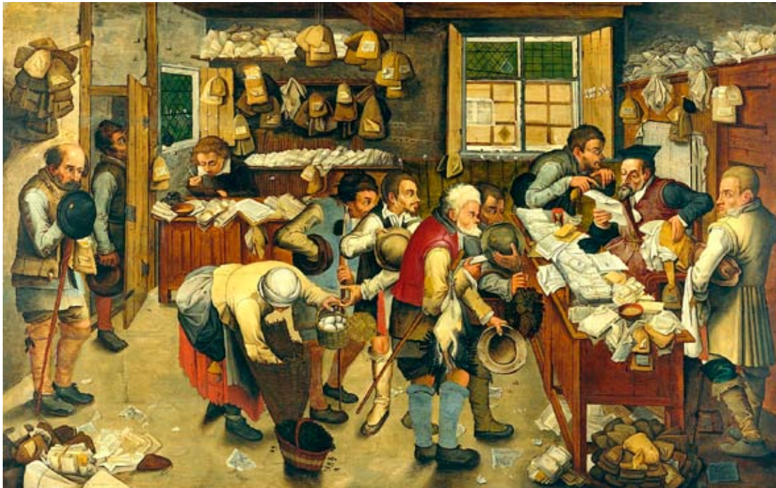
24. A tax collector's office , copy after Pieter Brueghel II (NK 2297).