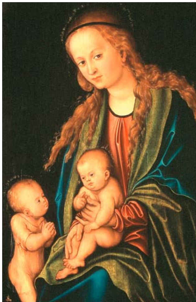
12. Mary with the Christchild and St. John the Baptist by Lucas Cranach (NK 1883).