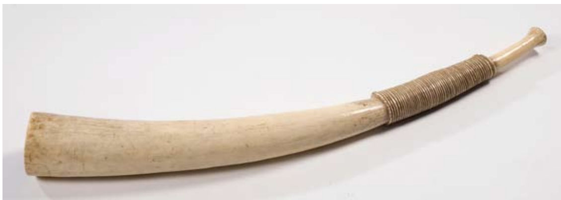
16. Hunting horn made of elephant tusk, Kassai (NK 396).